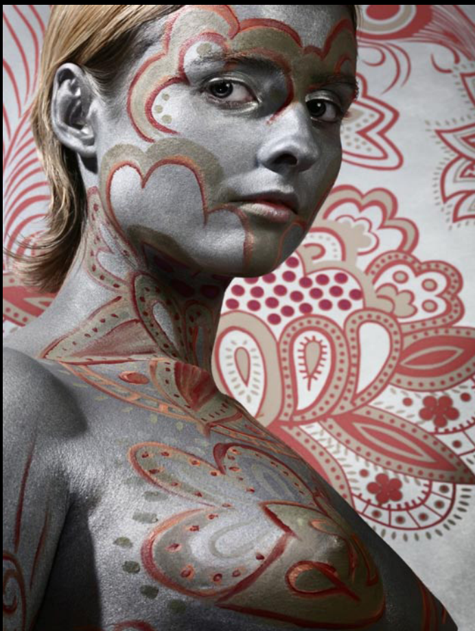
Wallpaper camouflage, photo: Luciano Cismondo, 2008